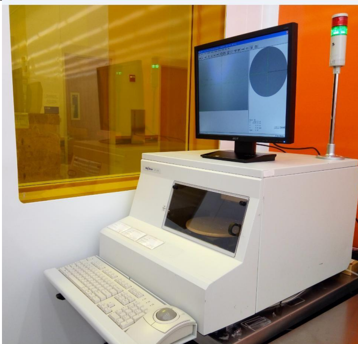
Figure 1 The P16 profiler, located in Keller Hall-Bay 1.